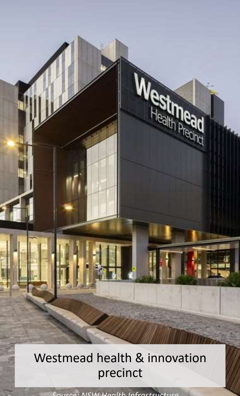
Westmead health & innovation precinct