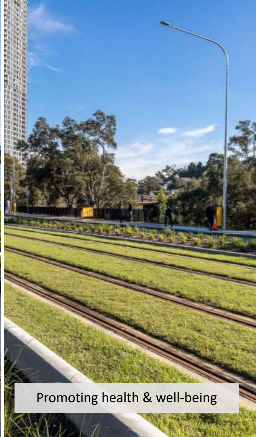
Promoting health & well-being