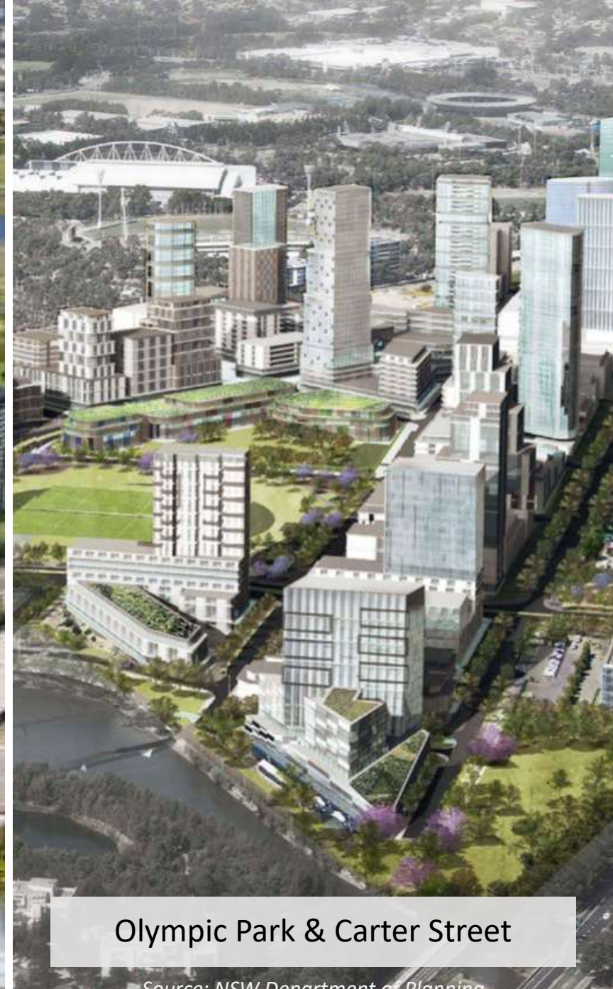
Olympic Park & Carter Street