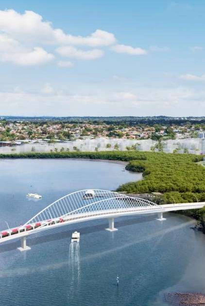
Safeguarding bridge design